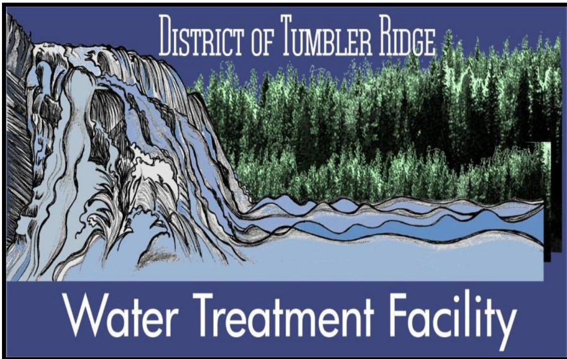
Figure 1 Displays the overall Water system.

A bulk water facility also supplies water to commercial water haulers from the community water system.